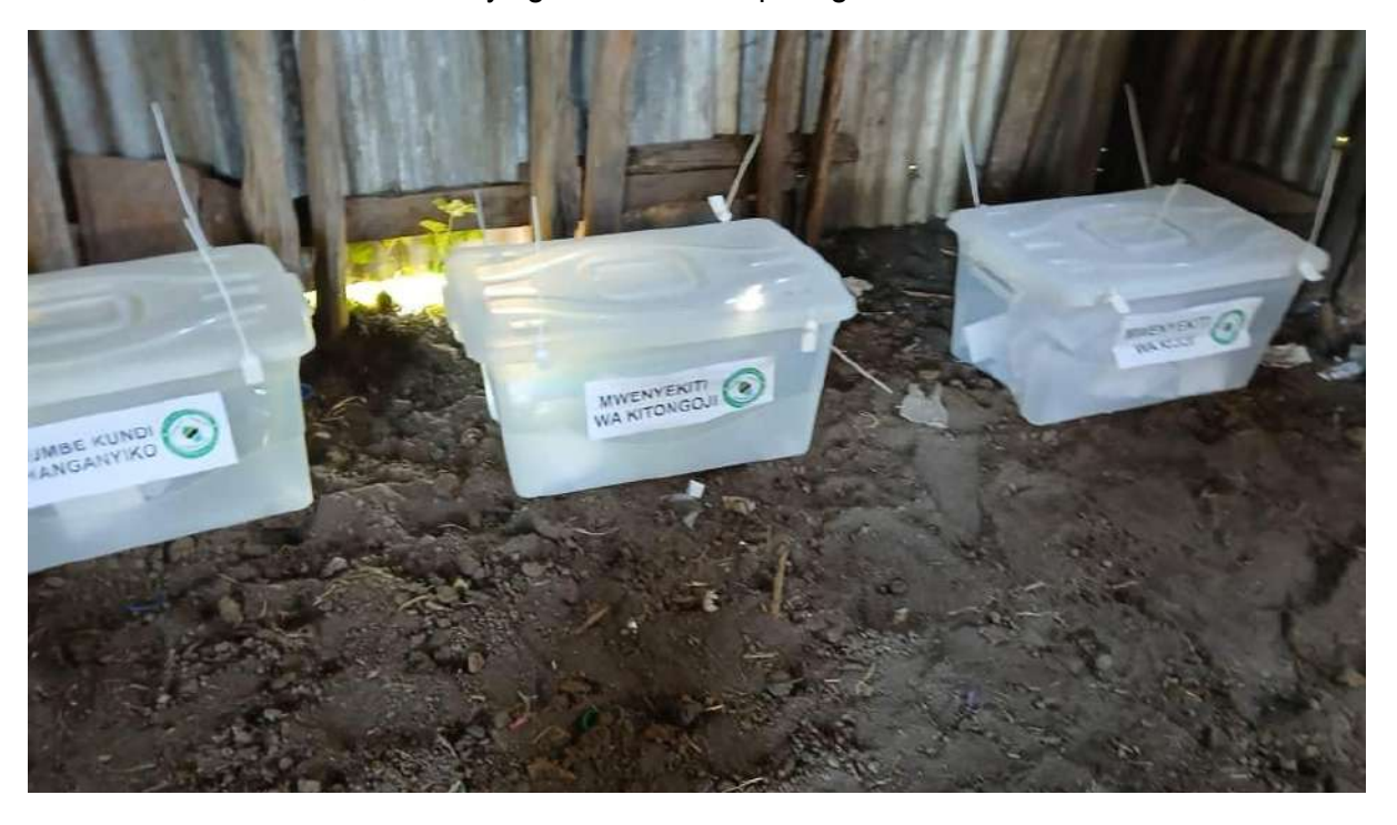
Photo: Ballot box for the election of chairpersons in Nasipooring village already half full with ballot papers before the actual opening of the vote.

On 27 November, local elections were organised in Tanzania to elect new village and hamlet chairpersons. After fearing that they would not be able to vote, as all their villages had been delisted (see previous MISA newsletter), Ngorongoro residents were satisfied to see elections happening. However, in many places, the Government made a coordinated effort to disqualify opposition candidates in order to give the ruling party Chama cha Mapinduzi (CCM) a clear winning streak. MISA was informed of several instances of election fraud, candidates' intimidation, vote buying and ballot tampering.