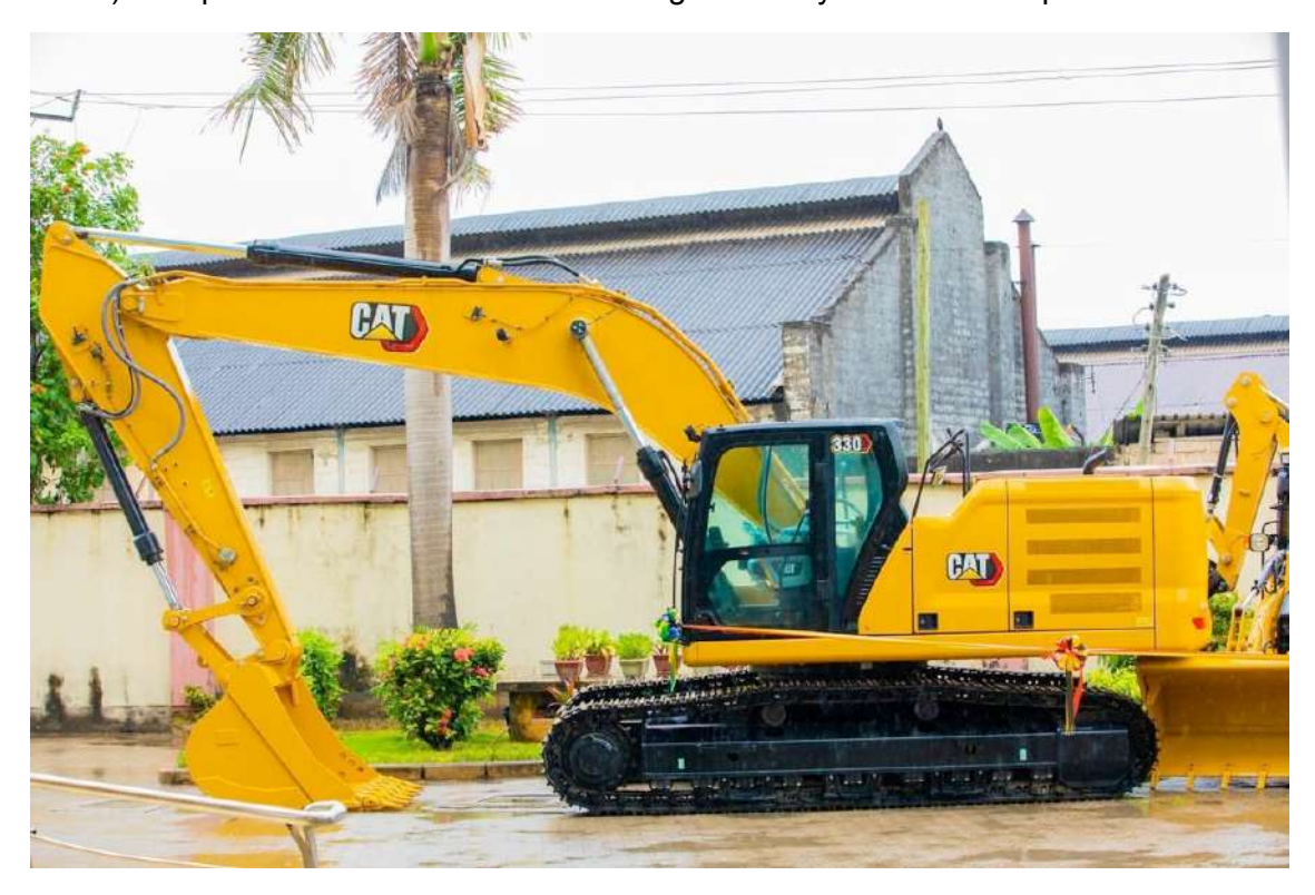
Photo: Vehicle provided by KfW to operate in Serengeti and Nyerere national parks.

In December, <u>TANAPA received machinery and trucks</u> worth 6.4 billion Tsh. (some 2.5 million Euros) to improve the infrastructure of Serengeti and Nyerere national parks.