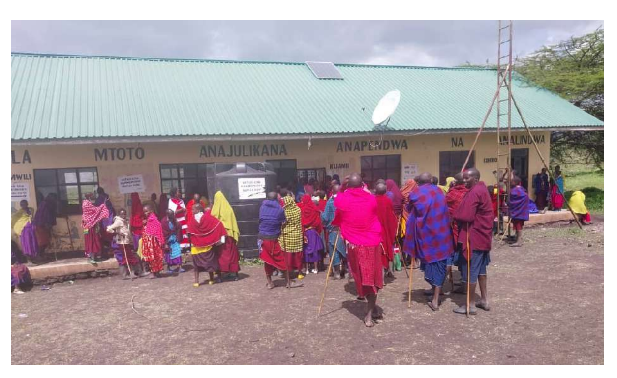
Photo: Several people at Nasipooriong' Voters Registration waiting to be registered as voters on 16th December 2024 after an initial attempt by NEC to disenfranchise them.

The National Electoral Commission (NEC) has reinstated voter registration in Ngorongoro, abandoning its previous decision in June to exclude Ngorongoro as part of areas in Tanzania eligible for voter registration and voting in Tanzania. This decision made a second U-turn by different government departments in relation to democratic rights of the Maasai in Ngorongoro following the Minister President Office Local Government reinstatement of villages that were delisted in August 2024.