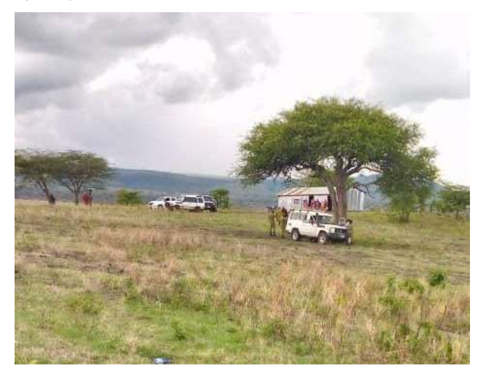
Photo: Police cars outside Ndoinyo polling station guarding ballots cast before commencement of election in November 2024.

This happened particularly in areas where the ruling party failed to even hold a campaign for lack of voting support and where it had a clear indication that it would lose the elections, as in the case of Nasipooriong village, where a <u>ballot box</u> for Ndoinyo sub-village was brought in with hundreds of ballot papers already filled before voting started. These practices undermine democratic principles, leaving communities frustrated and skeptical about the legitimacy of elected leaders.