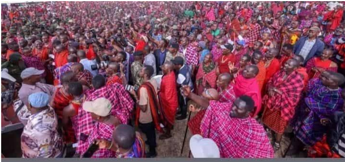
Crowd gathering in Ololosokwan, 8 September 2023

On 8 September, crowds gathered in Ololosokwan to hear Tanzanian opposition leader Tundu Lissu. It was expected that Lissu would cancel his visit to Loliondo following attempts to deny him the right to organise political rallies in Ngorongoro. But he was unstoppable. The Maasai want political change.