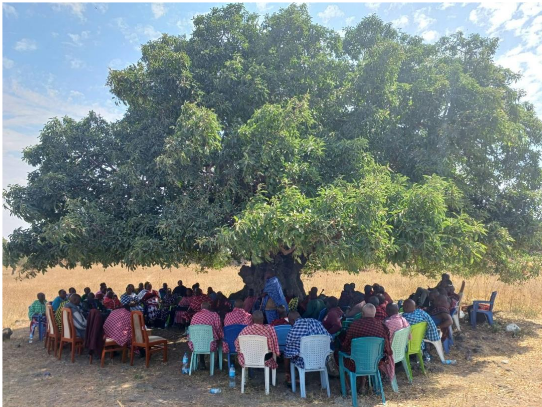
Meeting of traditional Maasai leaders in Siha, Kilimanjaro Region

Maasai leaders from 17 districts denounce state-organised Maasai Festival : “This fake festival is misusing Maasai culture.”