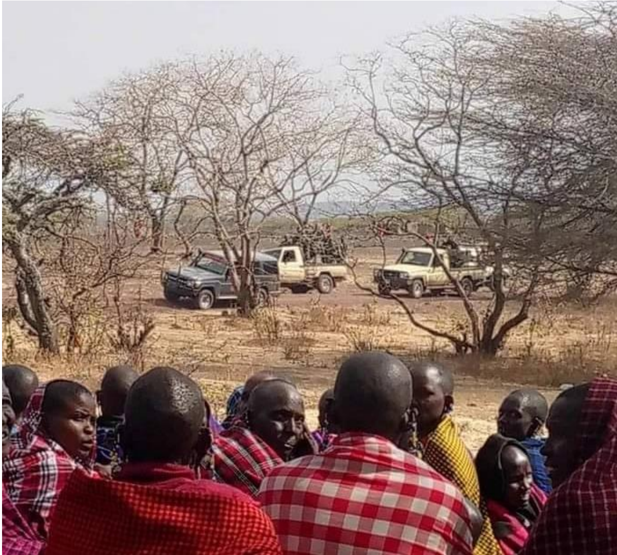
Riot police rounding up a women's gathering in Endulen on 10 September 2023. The women sit in peaceful protest against the government's denial of social services and refusal of Lissu's entry into Ngorongoro

teargas just a day after Tundu Lissu's entry denial into Ngorongoro to address three scheduled political rallies.