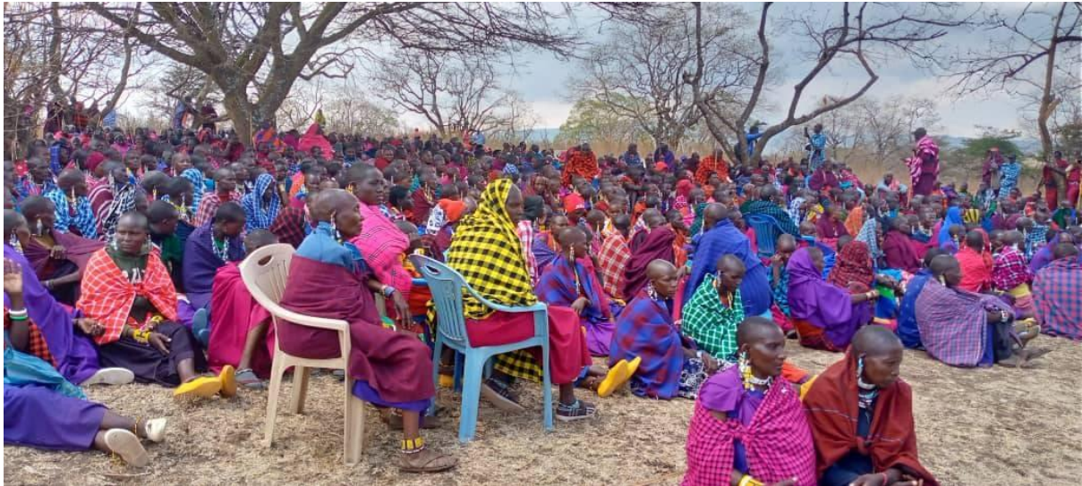
Maasai in NCA waiting for Tundu Lissu's political rally