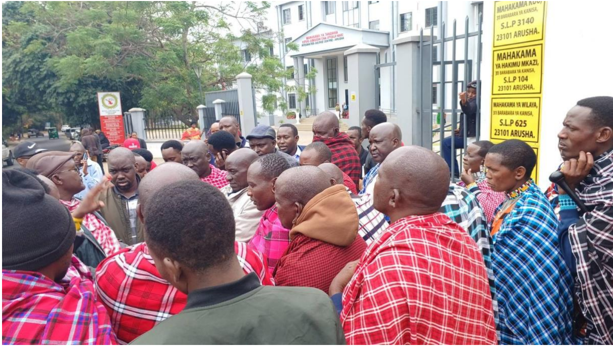
Maasai waiting outside of Arusha Court for Polelet ruling

Maasai leaders from 17 districts denounce state-organised Maasai Festival : “This fake festival is misusing Maasai culture.”