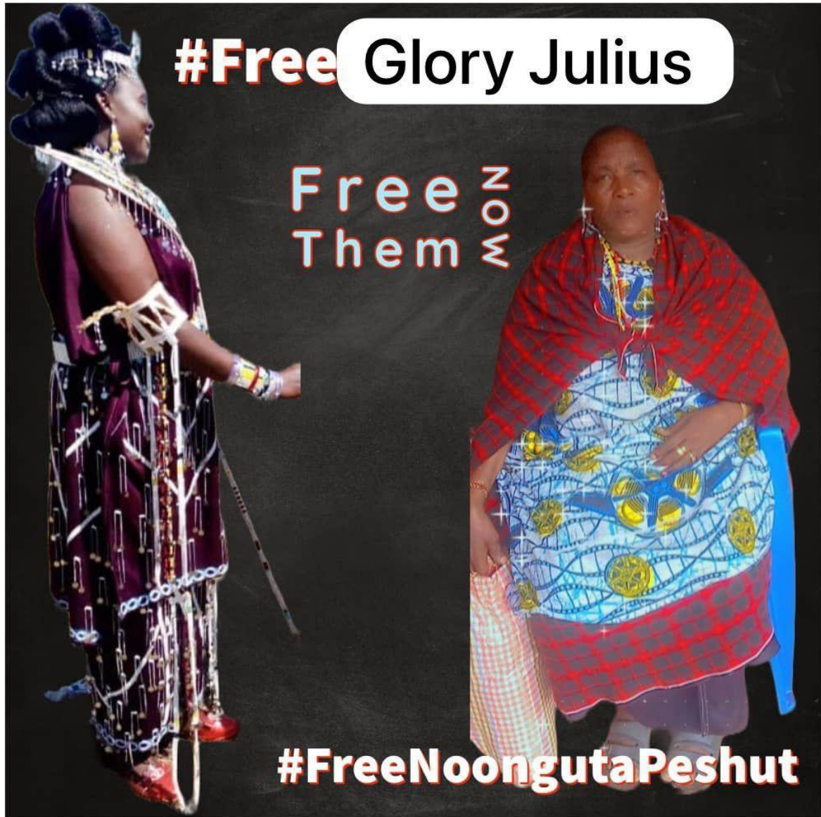
Social media campaign to get the two women released