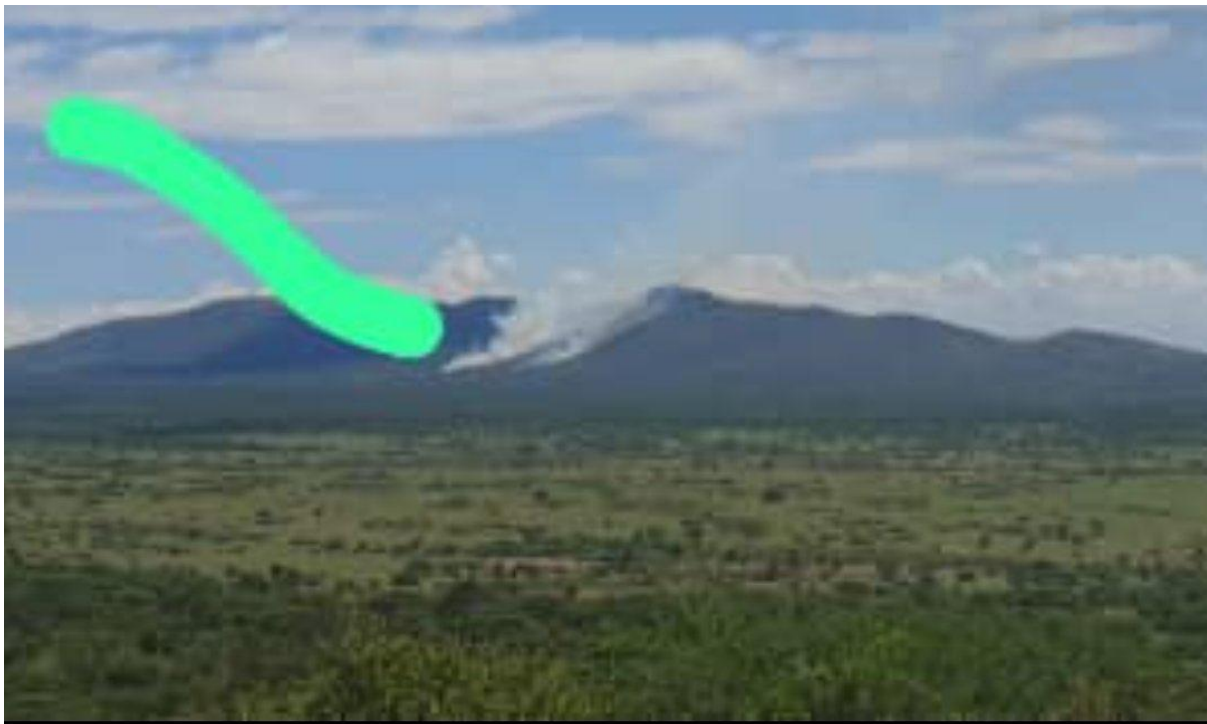
Photo: Mountain set on fire by game wardens as part of a livestock restriction strategy in different villages in Loliondo. Photo taken on 5 October 2023.

Following the Court Order against the Government that nullified the Pololeti GCA, the government started setting fire to different areas so the Maasai would not be able to graze their livestock. It looks like the government, while stating it is pro-conservation, prefers to burn all grass and release carbon into the atmosphere rather than allow Maasai pastoralists to rightfully access their lands for grazing.