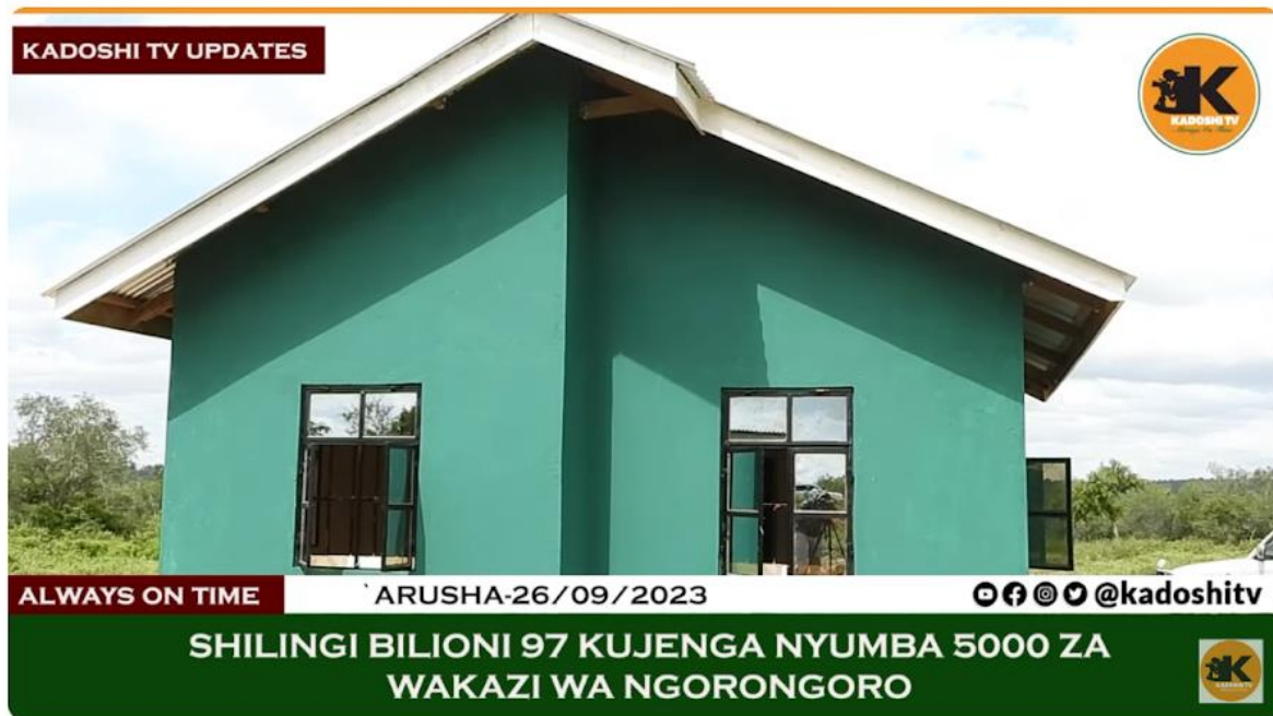
Photo: Houses built for the relocated (excerpt from informational video)

In early 2022, the TPDF and game wardens invaded Msomera village and forcefully annexed land so that the Tanzanian military could build 500 houses. The cost for construction of 500 houses in Msomera was nine million USD, making an average of eighteen thousand USD per two-room house.