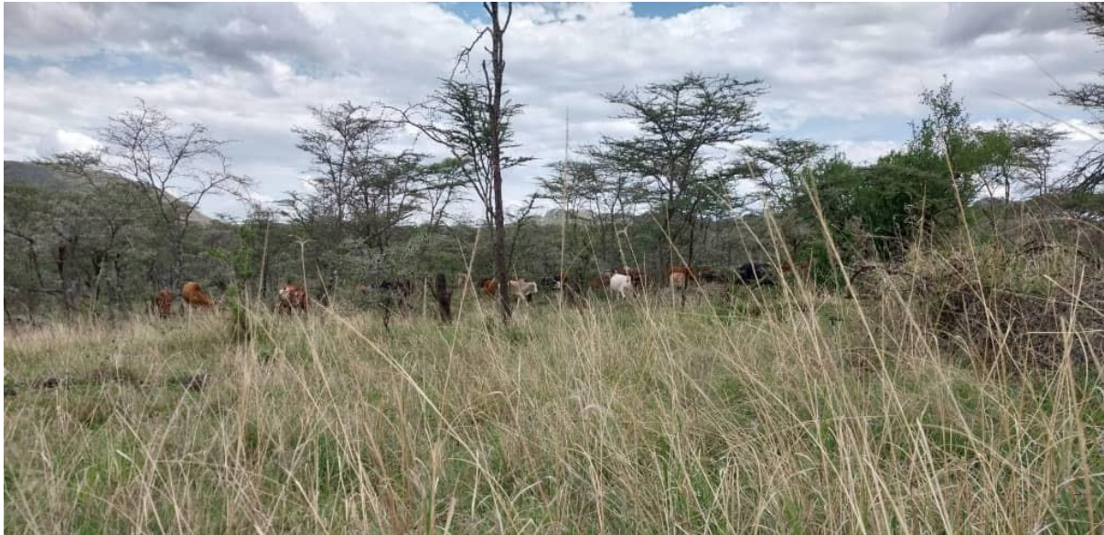
Photo: Following the Court Order, Maasai are grazing their cows in formerly confiscated area

On 31 October 2023, SENAPA (Serengeti National Park Authority) secretly obtained a Court Order in Musoma District to sell 806 cattle, 420 sheep and 100 goats as unclaimed property, despite clear evidence that the owners are known by name and had been following their cattle for five days. Before this Court Order was even secured, 227 cattle and 200 sheep and goats were apparently sold by rangers. On 1 November 2023, the High Court of Musoma issued a stop order against selling the livestock. SENAPA rangers have continued selling all of them despite the Court Order. MP Oleshangai tried to intervene by making a call to a SENAPA Game Warden named Moronda, the Deputy Minister and subsequently the Minister of Natural Resources and Tourism, all in vain.