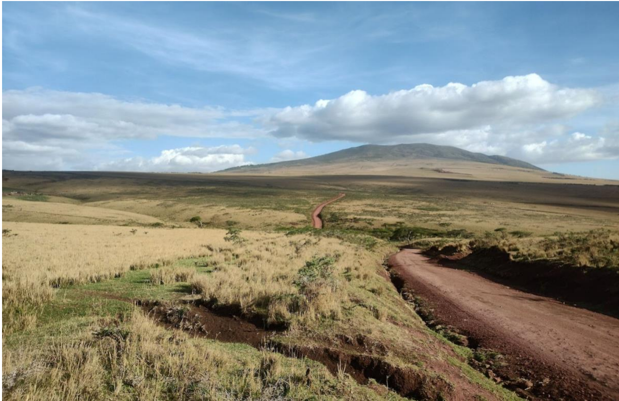
Photo: Ngorongoro Conservation Area (NCA), October 2023. NCA is a conservation area and not a national park. This means people can live in NCA and it is the responsibility of the government to protect the interests of local communities and help them develop.