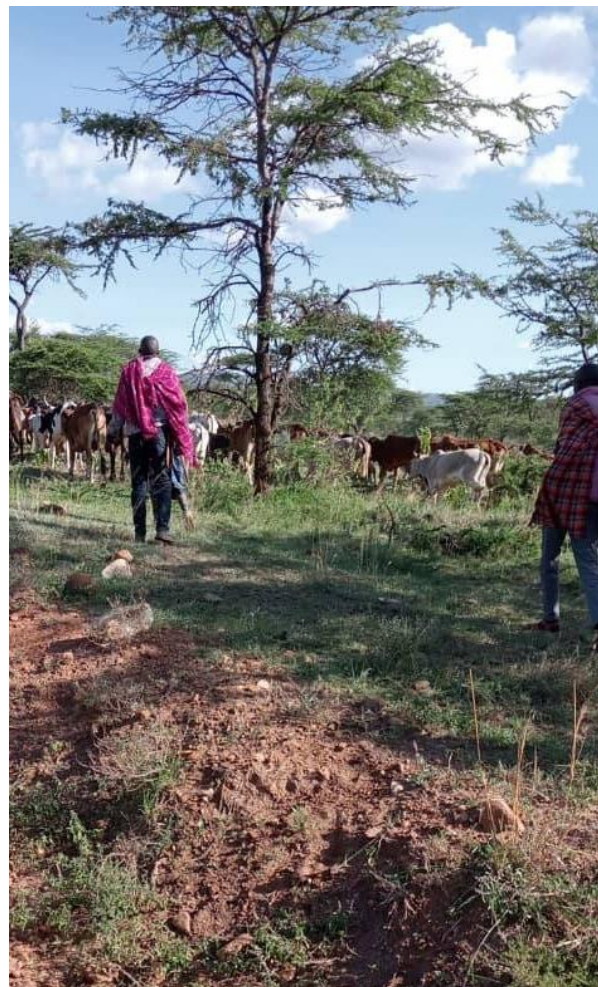
Photo: 6 October 2023, Maasai are taking their cows back to graze in their rightful land