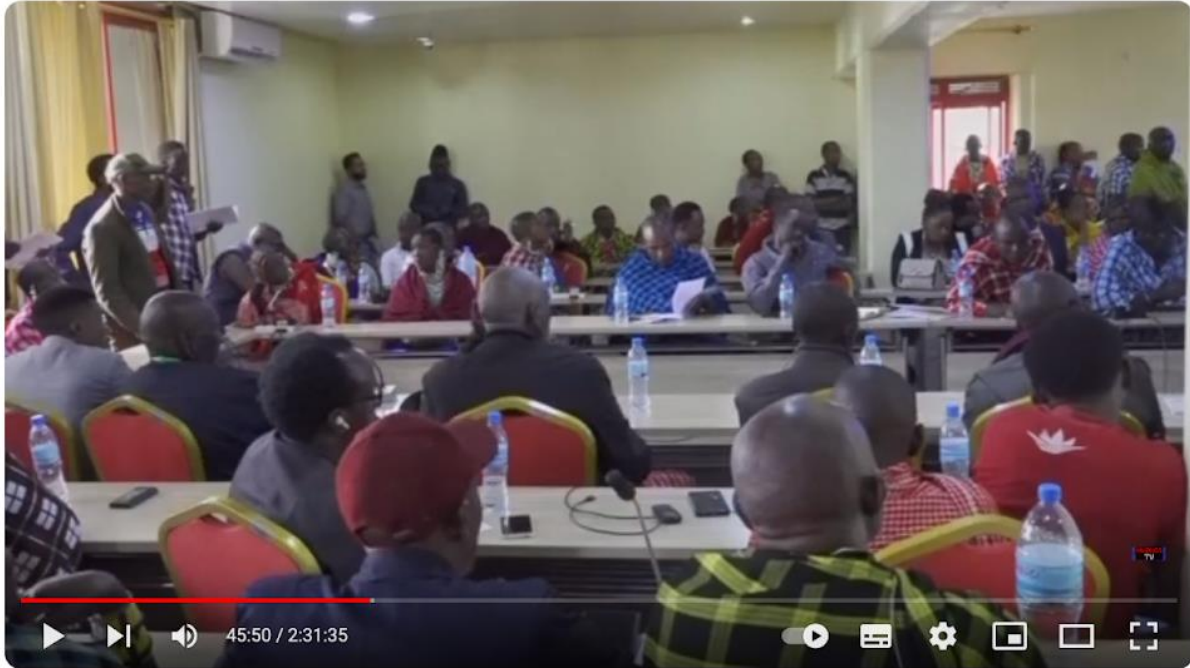
Photo: Excerpt from the recording of the side event on 24 October 2023.

On 24 October 2023, the Maasai organised a side event at the African Commission on Human and Peoples' Rights in Arusha entitled " Coercive Conservation is broken ", highlighting the case of Ngorongoro and Loliondo.